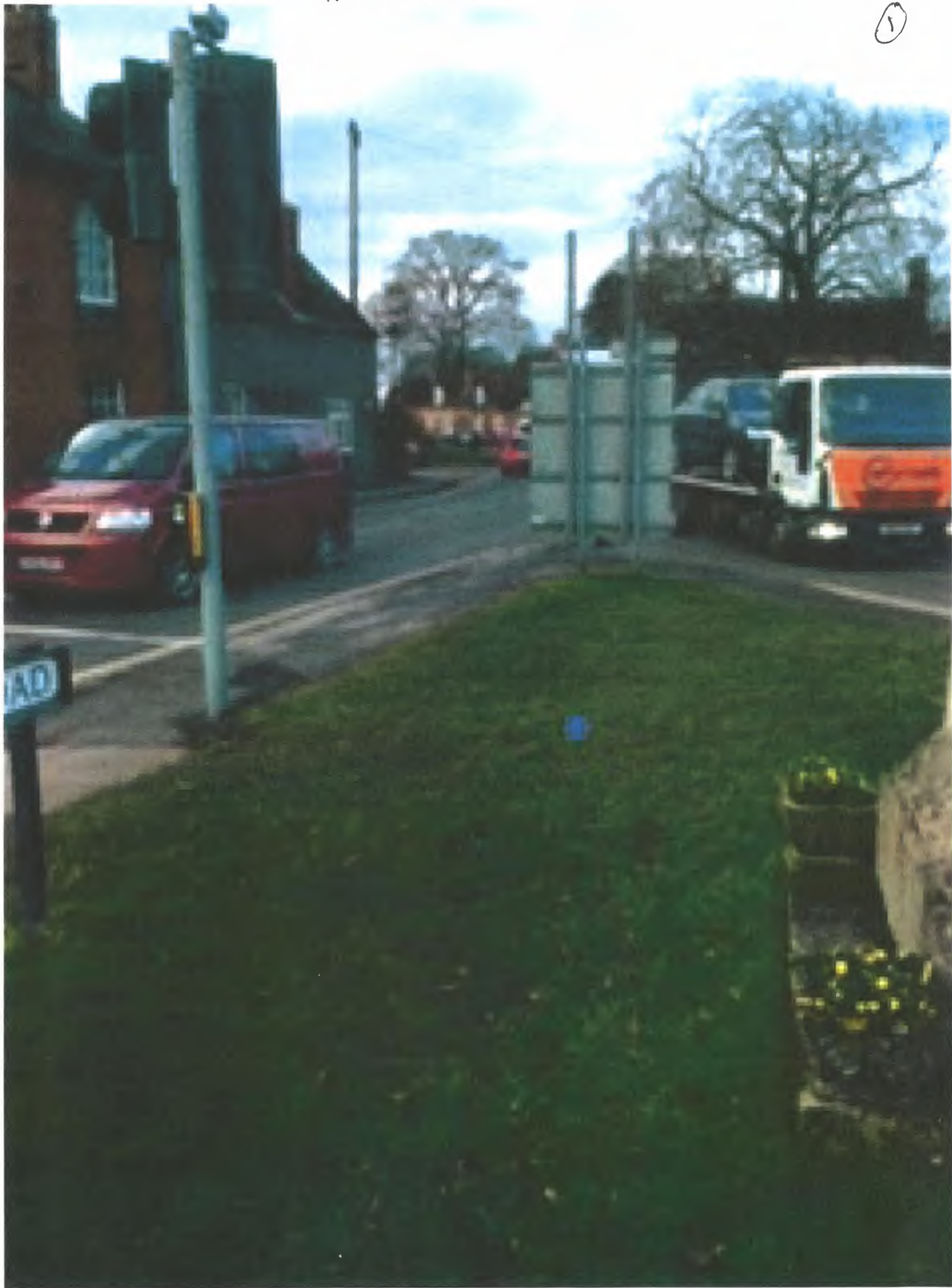
LORD JOHN TO ROAD 14'