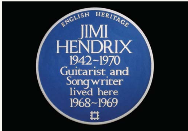
25 A factor in considering nominations for plaques will be the popularity of a particular subject, as well as their significance. This plaque, erected by English Heritage in 1997, honours Jimi Hendrix, who lived at 23 Brook Street, Mayfair, London, for several months in 1968-69, a period of importance within his life and career.

It is always worth questioning whether a particular association is important enough to justify a plaque. This is especially relevant when considering whether or not to commemorate a person's stay at a hotel or guest house, which may have lasted only for one or two nights' duration. A case in point is the plaque erected in 2006 by Dartford Borough Council on the site of The Bull and George Inn in Dartford, where the novelist Jane Austen (1775-1817) occasionally stayed on the way to visit her brother at Godmersham Park, near Canterbury. Drawing attention to such a slight connection with a particular place – which of course would have been shared by hundreds if not thousands of other guests who stayed at the inn – can undermine a plaque's primary purpose, which is to mark places and associations of special historical significance. Spa towns and resorts, such as Bath, present particular problems in this regard for they have welcomed innumerable visitors, many of whom spent only a few weeks or months at a particular address.