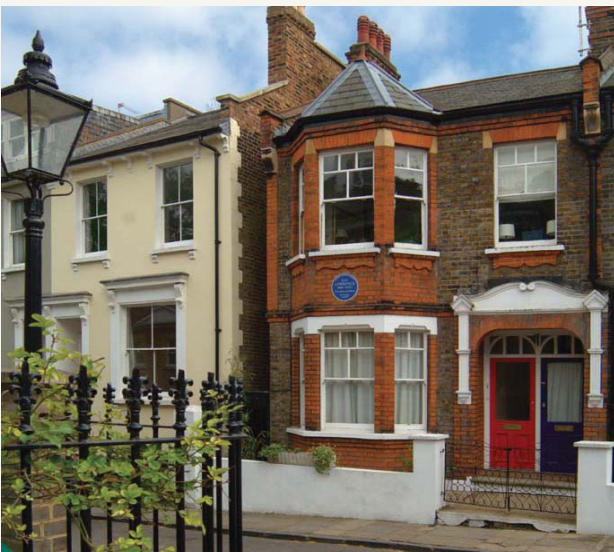
23 Buildings listed on account of their historical associations include 1 Byron Villas, Hampstead, London, the former home of the writer D. H. Lawrence (1885-1930).

One of the most notable features of commemorative plaques is their power to surprise and, through this, to educate. They serve to draw out historical associations which would not otherwise be evident, bringing aspects of history before people who may not otherwise have sought or found it out. For English Heritage, this is a key consideration. Where a link is already found to have been marked or celebrated (perhaps by a museum or a pre-existing tablet), the need for an additional plaque is felt to be negligible. With this in mind, it is interesting that the Transport Trust, in assessing nominations for plaques, ranks a 'hidden gem' higher than a site already nationally recognised. As is outlined elsewhere (see pp. 77-78), it is the obligation of all those who erect plaques to ensure that they are sensitive to the historic environment, and to question the appropriateness of erecting a plaque, especially where it constitutes an addition that duplicates existing information. The chief aim should be the commemoration of a particular subject, rather than the erection of a particular plaque, and the means by which this is best done should be carefully explored.