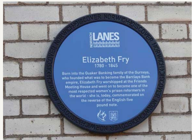
26 Plaques may play an educational role by drawing attention to subjects who were of significance, but whose names are not necessarily well known. An example is Elizabeth Fry, prison reformer, commemorated at the Friends Meeting House, Upper Goat Lane, with a plaque erected under the joint initiative of Norwich HEART and Norwich City Council.

A number of other schemes have followed a similar approach (and, indeed, wording), both with regard to a figure's significance and the need for a positive contribution. However, while the criteria of English Heritage require that figures, events or institutions be of national (or even international) significance – an approach that reflects the historical richness of London and the national remit of EH – such considerations may not be applicable to other schemes, especially those focused on particular geographical areas.