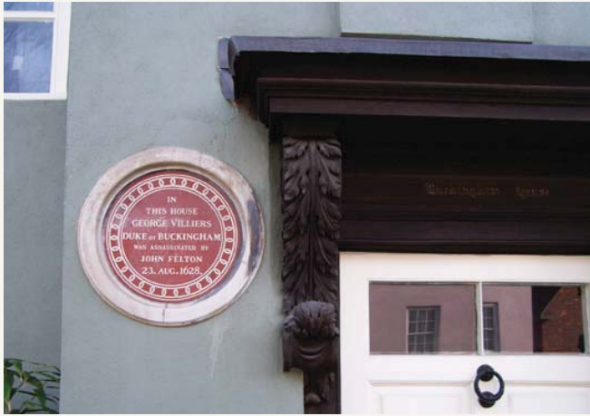
22 Not all plaques are celebratory, as is shown by this example marking the site of the assassination of George Villiers (1592-1628), Duke of Buckingham – Buckingham House, 11 High Street, Old Portsmouth. Its design is clearly based on the plaques erected in London by the Society of Arts between 1866 and 1901.